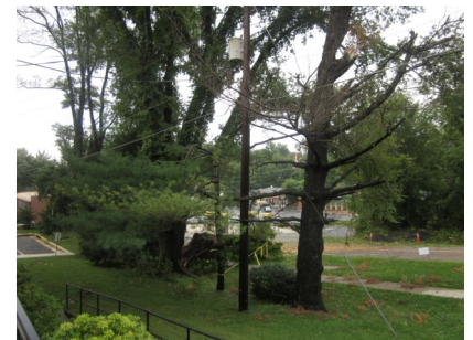
Tree damage caused by Irene